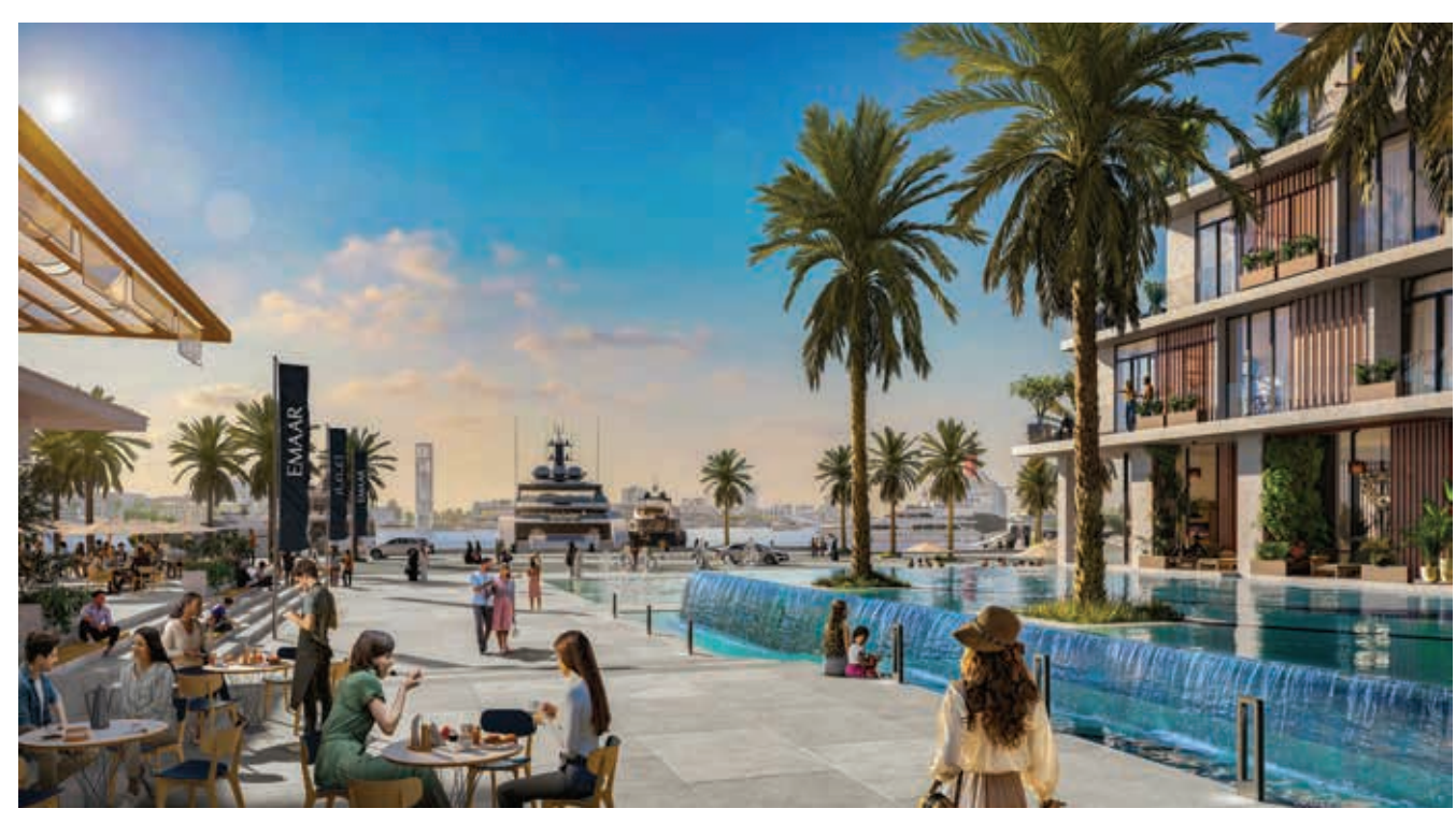
*Attributable to Owner